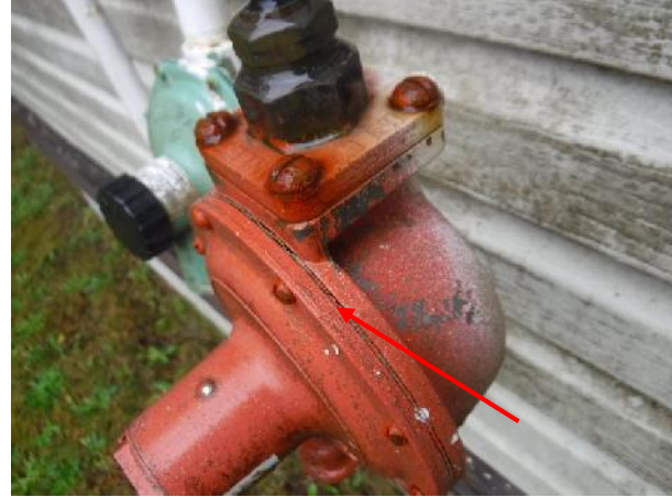
Photo 6 Description: Gasket Location: Exterior old gas hookup location Asbestos: Suspect