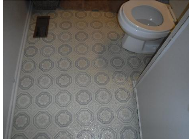
Photo 2 Description: Sheet flooring 3 – octagon and square pattern Location: Laundry Room Asbestos: Suspect