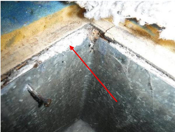
Photo 5 Description: Heat register vibration dampener Location: Living Room Asbestos: Suspect