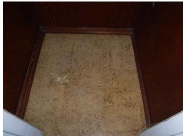
Photo 4 Description: Floor tile 1 – 9”x9” yellow with brown Location: Hallway Closet Asbestos: Suspect