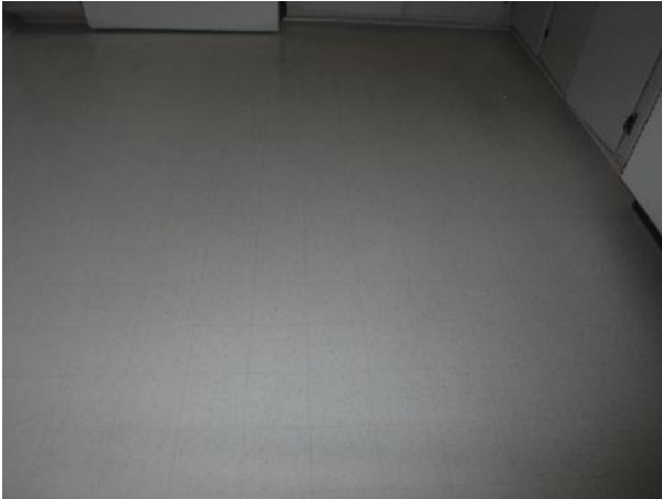
Photo 1 Description: Sheet flooring 1 – 4”x4” off white squares Location: Kitchen Asbestos: Suspect

The following photo plates provide a general documentation of the building materials that were sampled and analyzed, and observations made during the assessment. They are meant to summarize the results of analysis and observations and are not intended to include all hazardous materials, or their locations, observed during the assessment.