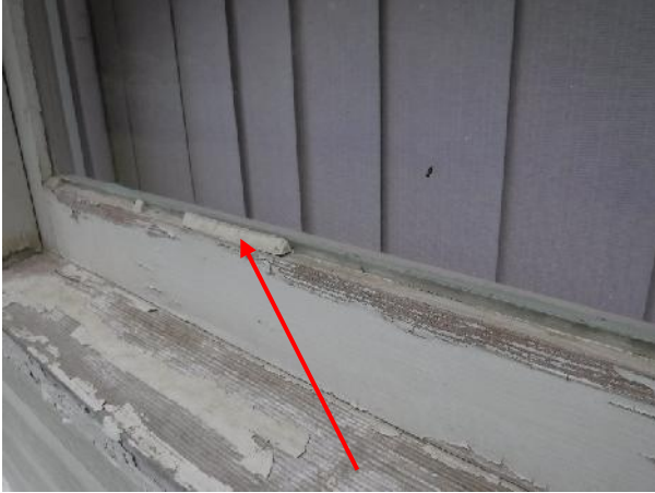
Photo 5 Description: Window putty – white Location: Exterior Asbestos: Suspect