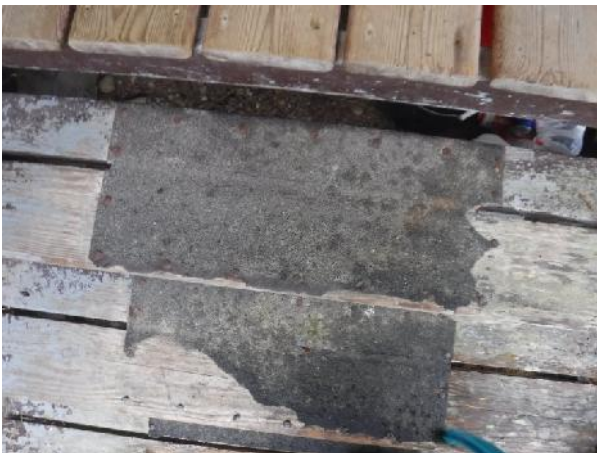
Photo 3 Description: Asphalt stair tread Location: Exterior Asbestos: Suspect