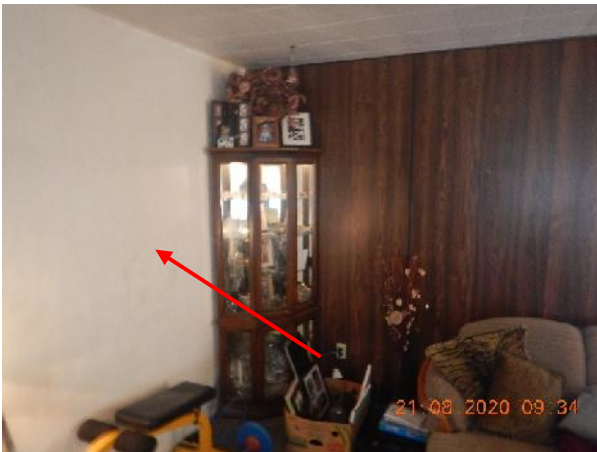
Photo 3 Description: Textured drywall with joint compound Location: Living Room Asbestos: Suspect