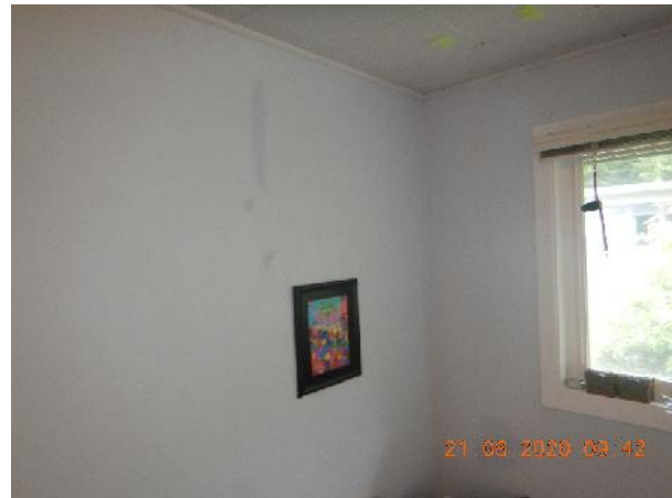
Photo 4 Description: Drywall with joint compound Location: Bedroom 2 Asbestos: Suspect