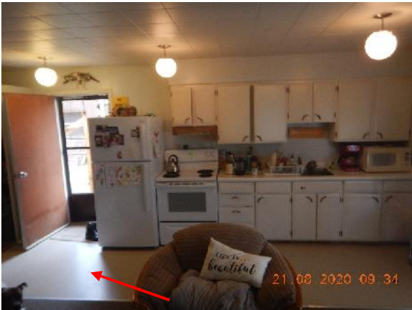
Photo 1 Description: Sheet flooring 1 – light grey with white and grey specks Location: Kitchen Asbestos: Suspect

The following photo plates provide a general documentation of the building materials that were sampled and analyzed, and observations made during the assessment. They are meant to summarize the results of analysis and observations and are not intended to include all hazardous materials, or their locations, observed during the assessment.