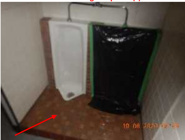
Photo 7 Description: Brown 2"x2" ceramic tile grout and thinset Location: Boys Washroom by Staff Room Asbestos: Suspect concealed asbestos leveling compound(s)