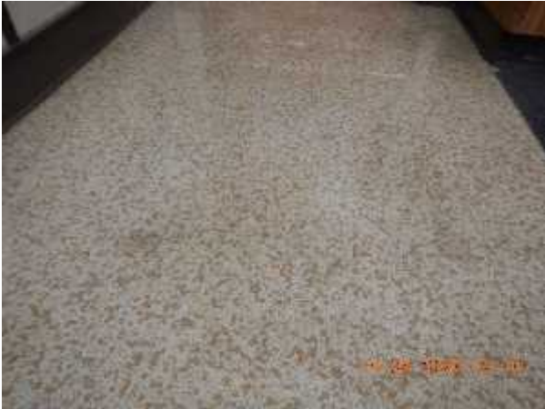
Photo 1 Description: Sheet flooring 1 – Beige mosaic Location: Room 104 Asbestos: 20% Chrysotile Sample(s): 30001-1

The following photo plates provide a general documentation of the building materials that were sampled and analyzed, and observations made during the assessment. They are meant to summarize the results of analysis and observations and are not intended to include all hazardous materials, or their locations, observed during the assessment.