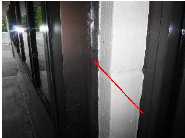
Photo 16 Description: Mastic – Brown (Where metal frame meets concrete block) Location: Entry Hallway Asbestos: Suspect