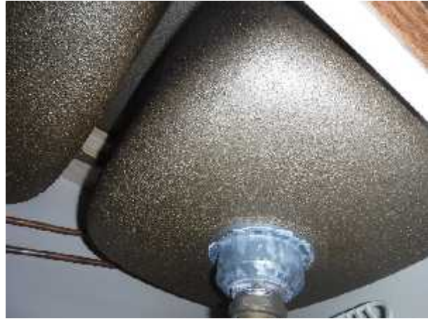
Photo 14 Description: Mastic type 1 – Gold/silver Location: Kitchen off Gym Asbestos: Suspect