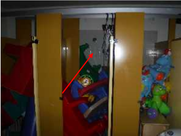
Photo 5 Description: Ceramic tile grout and thinset Location: Girl's Change Room Asbestos: Suspect concealed asbestos leveling compound(s)