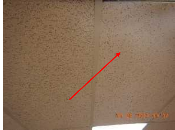
Photo 10 Description: Acoustic ceiling tile type 4 – Pinhole with random small and large fissures