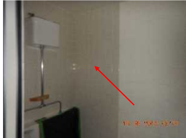
Photo 6 Description: Beige 6"x6" ceramic tile grout and thinset Location: Boys Washroom by Staff Room Asbestos: Suspect concealed asbestos leveling compound(s)