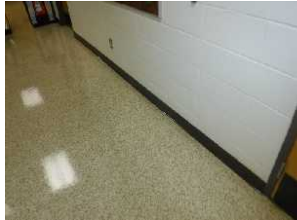
Photo 20 Description: Baseboard adhesive Location: Hallway Asbestos: Suspect