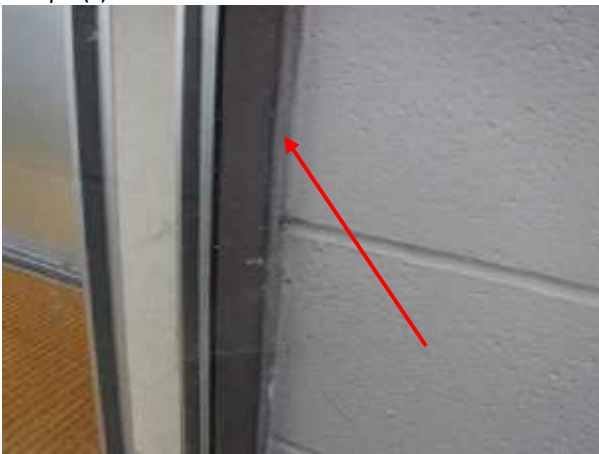
Photo 3 Description: Caulking – Brown Location: Exterior Asbestos: Suspect