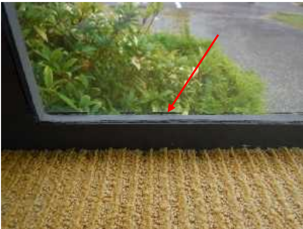
Photo 15 Description: Mastic – Black Location: Room 105 Asbestos: Suspect