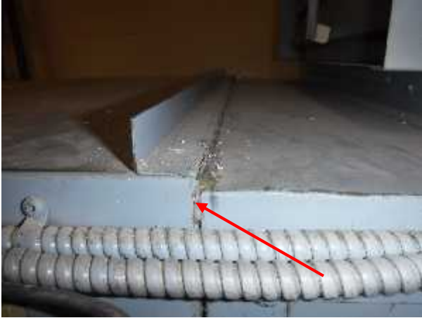
Photo 17 Description: Mastic –Grey Location: Mechanical Room Asbestos: Suspect