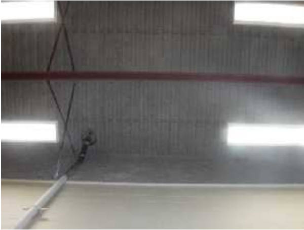
Photo 13 Description: Spray on insulation – Grey Location: Gym Asbestos: Suspect