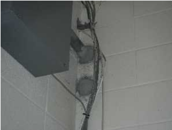
Photo 19 Description: Penetration parging Location: Mechanical Room Asbestos: Suspect