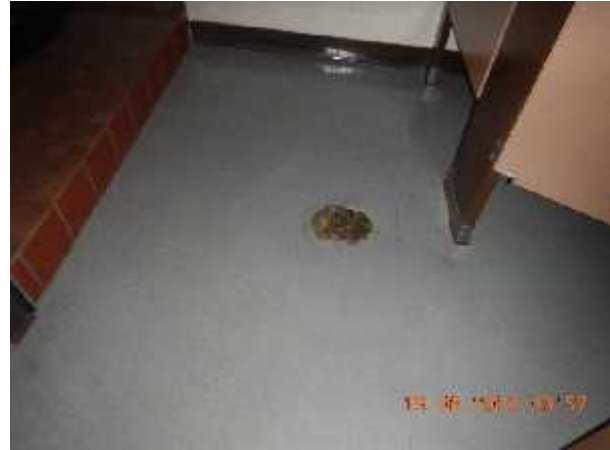
Photo 2 Description: Sheet flooring 2 – Grey Location: Boys Washroom by Staff Room Asbestos: 20% Chrysotile Sample(s): 30001-5