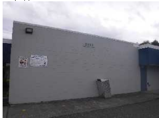
Photo 4 Description: Concrete block Location: Exterior Asbestos: Suspect (may contain vermiculite insulation)