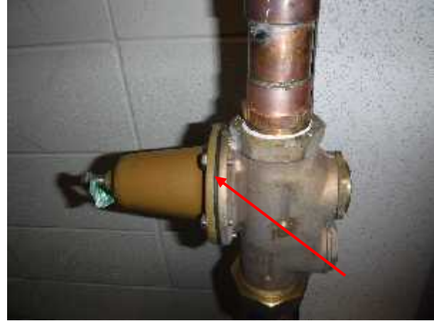
Photo 18 Description: Gasket Location: Mechanical Room Asbestos: Suspect