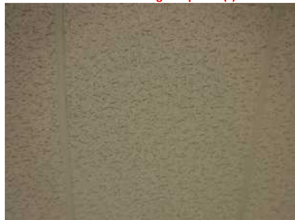
Photo 8 Description: Acoustic ceiling tile type 2 – Latitudinal fissure small and large pinhole Location: Room 105 Asbestos: Suspect