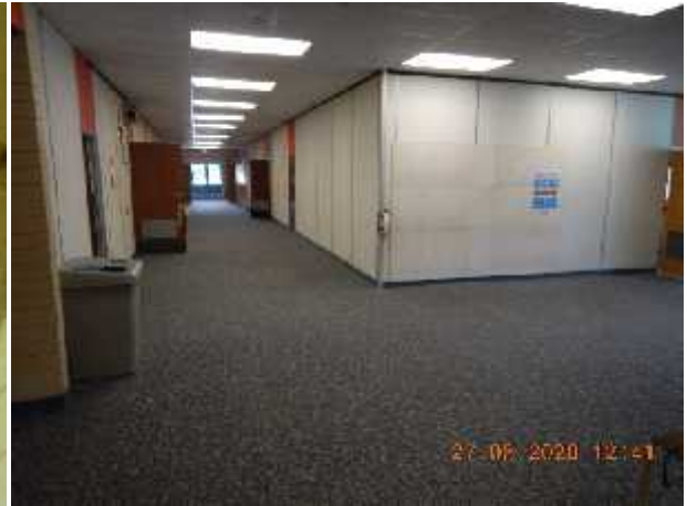
Photo 8 Description: Carpet adhesive Location: Hallway Asbestos: Suspect