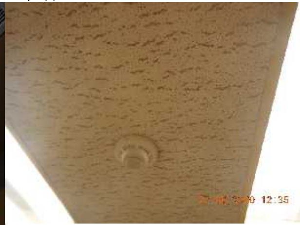
Photo 4 Description: Ceiling tile (acoustic) type 3 – vertical fissure with small and large pinholes Location: Janitor/ Custodian Room Asbestos: Suspect