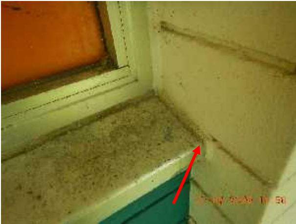
Photo 7 Description: Window caulking – grey/black Location: Exterior Asbestos: Suspect