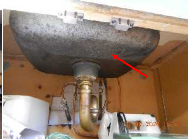
Photo 2 Description: Mastic – Black/brown on sink Location: Room 1 Asbestos: 3.2% Chrysotile Sample(s): 30012-9