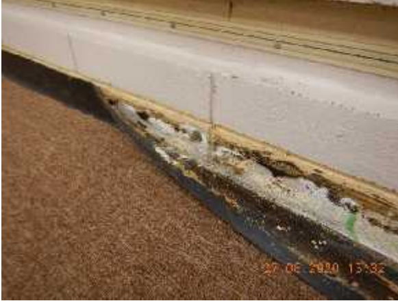
Photo 13 Description: Baseboard adhesive Location: Room 4 Asbestos: Suspect