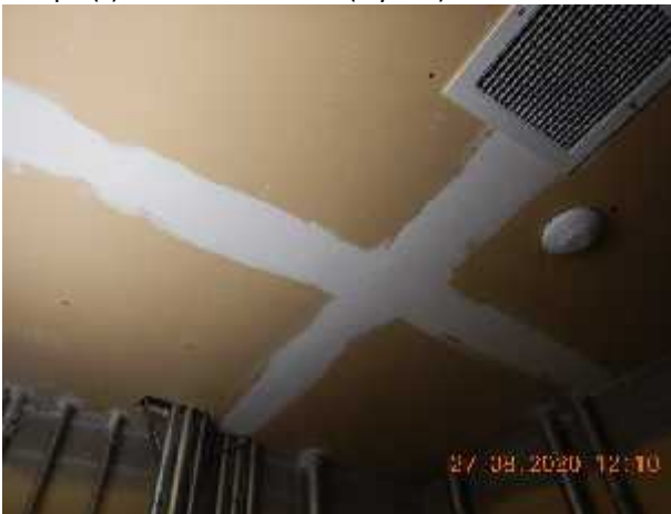
Photo 3 Description: Drywall joint compound Location: Electrical Room Asbestos: Suspect