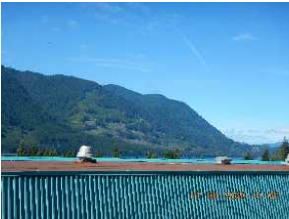
Photo 11 Description: Torch on roofing Location: Building roof Asbestos: Suspect