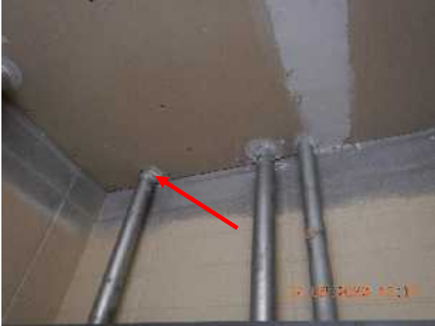
Photo 5 Description: Penetration caulking – white Location: Electrical Room Asbestos: Suspect