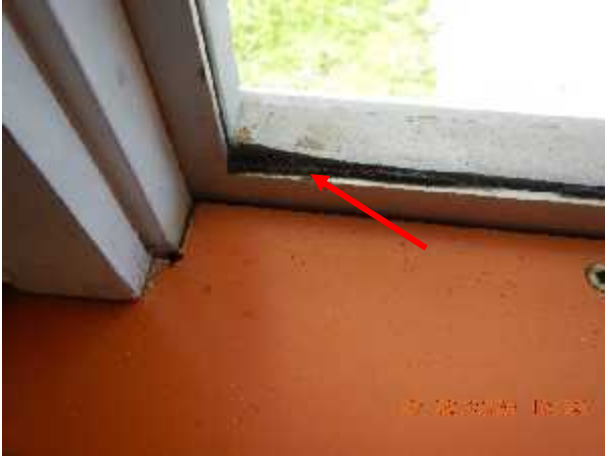
Photo 9 Description: Window putty – black Location: Room 5 Asbestos: Suspect