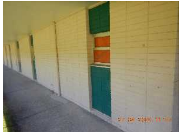
Photo 12 Description: Vermiculite insulation Location: Perimeter walls Asbestos: Suspect