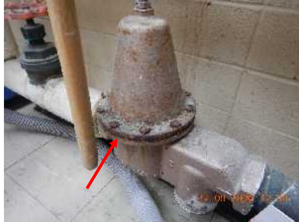
Photo 14 Description: Fitting gasket Location: Janitor / Custodian Room Asbestos: Suspect