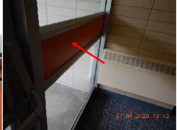
Photo 10 Description: Door panels Location: Foyer (West Entrance) Asbestos: Suspect