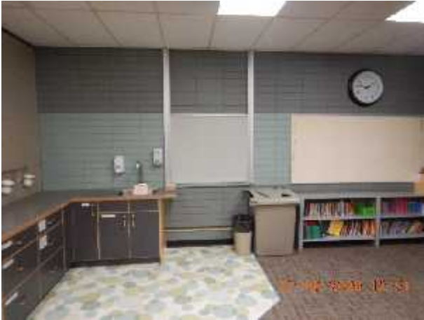
Photo 1 Description: Sheet flooring type 3 – unknown pattern below sheet flooring type 2 (circles pattern) Location: Room 2 Asbestos: 15% Chrysotile Sample(s): 30012-7 (layer 1)

The following photo plates provide a general documentation of the building materials that were sampled and analyzed, and observations made during the assessment. They are meant to summarize the results of analysis and observations and are not intended to include all hazardous materials, or their locations, observed during the assessment.