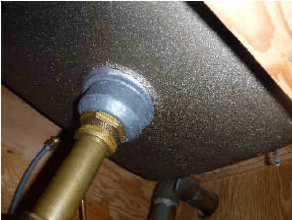
Photo 11 Description: Mastic – Gold on sink Location: Teachers Work Area Asbestos: Suspect