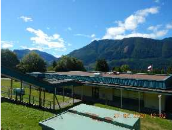
Photo 13 Description: Torch-on roofing Location: Building roof Asbestos: Suspect