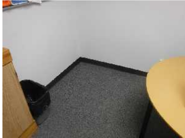
Photo 14 Description: Baseboard adhesive Location: Library office Asbestos: Suspect