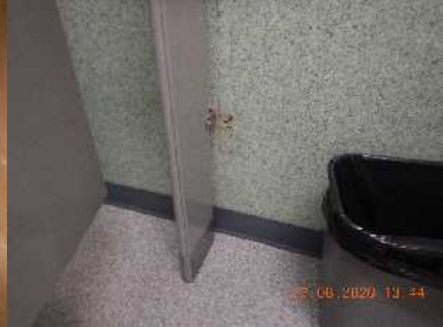
Photo 6 Description: Cement board Location: Storage Room Asbestos: 31% Chrysotile Sample(s): 39957-56b