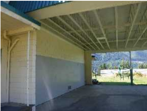
Photo 15 Description: Potential vermiculite insulation in concrete block wall cavities Location: Gym Asbestos: Suspect