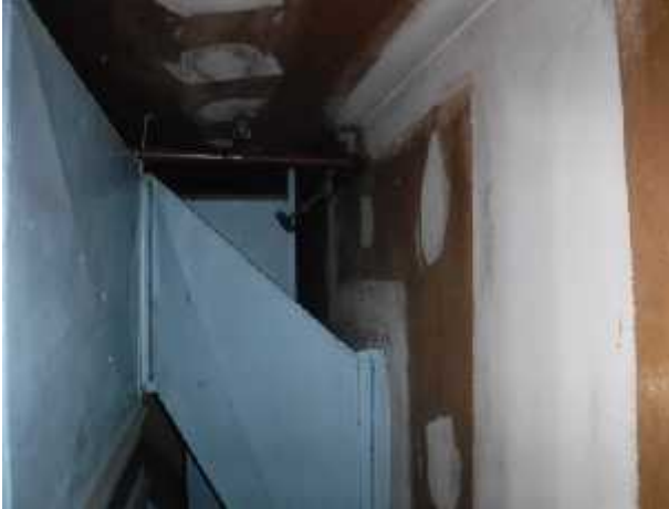
Photo 5 Description: Ductwork caulking (grey) Location: Mechanical Room Asbestos: 10% Chrysotile Sample(s): 30709-21b