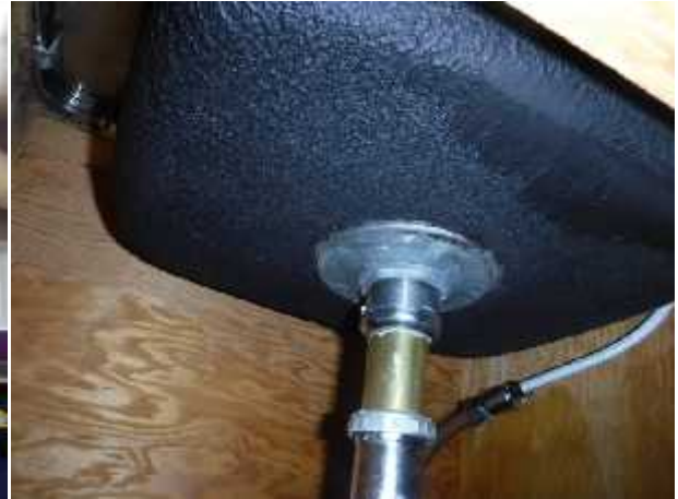
Photo 2 Description: Mastic – Black on Sink Location: Classroom 1 Asbestos: 10% Chrysotile Sample(s): 30709-7