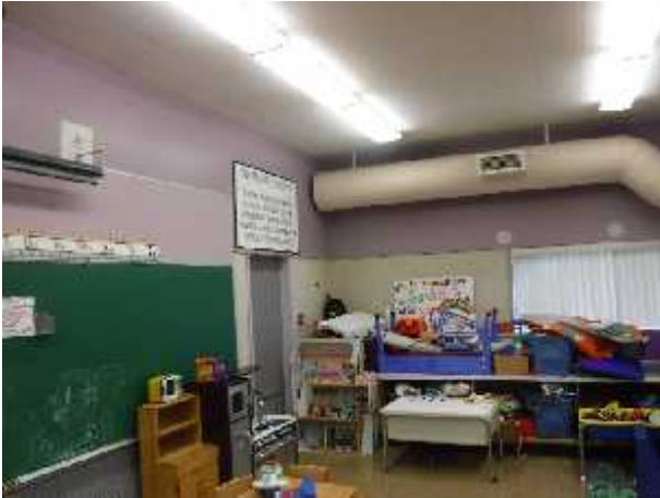
Photo 1 Description: Drywall Joint Compound Location: Classroom 1 Asbestos: 1.6% Chrysotile Sample(s): 30709-8 (layer 2)

The following photo plates provide a general documentation of the building materials that were sampled and analyzed, and observations made during the assessment. They are meant to summarize the results of analysis and observations and are not intended to include all hazardous materials, or their locations, observed during the assessment.