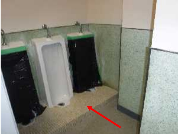
Photo 9 Description: 1"x1" White and gold ceramic tile grout and thinset Location: Boy's Washroom Asbestos: Suspect