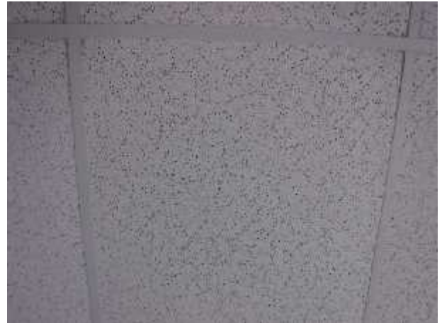
Photo 8 Description: Ceiling tile (acoustic) type 1 - patterned fissure Location: Classroom 5 Asbestos: Suspect