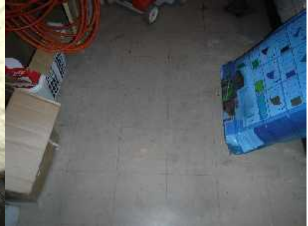
Photo 4 Description: Floor Tile 3: 9"x9" beige tile Location: Custodian/Janitor Room Asbestos: 1.2% Chrysotile Sample(s): 30709-11