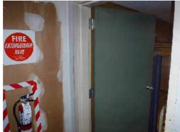
Photo 12 Description: Fire door Location: Mechanical Room Asbestos: Suspect