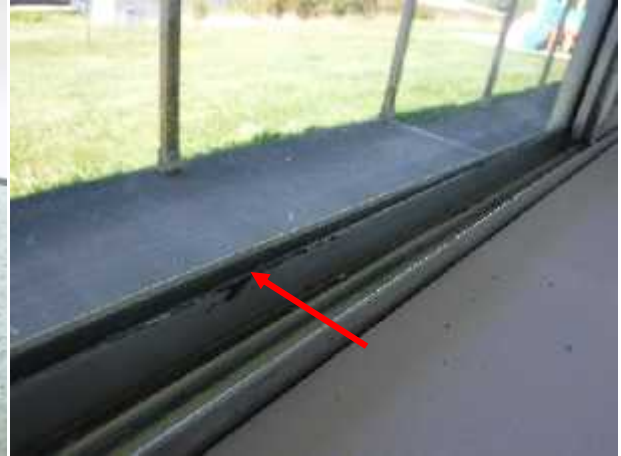
Photo 10 Description: Window putty – Black Location: Classroom 1 Asbestos: Suspect