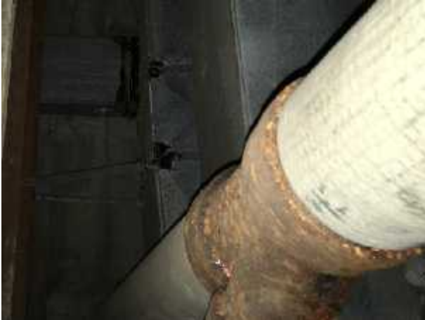
Photo 3 Description: Cement Pipe Location: Crawlspace Asbestos: 30% Chrysotile 10% Crocidolite Sample(s): 30709-11