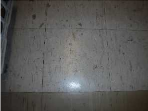
Photo 1 Description: Floor tile 1 – 12"x12" brown and beige with white streaks Location: Autoshop Storage and Hot Water Tank Asbestos: Suspect

The following photo plates provide a general documentation of the building materials that were sampled and analyzed, and observations made during the assessment. They are meant to summarize the results of analysis and observations and are not intended to include all hazardous materials, or their locations, observed during the assessment.