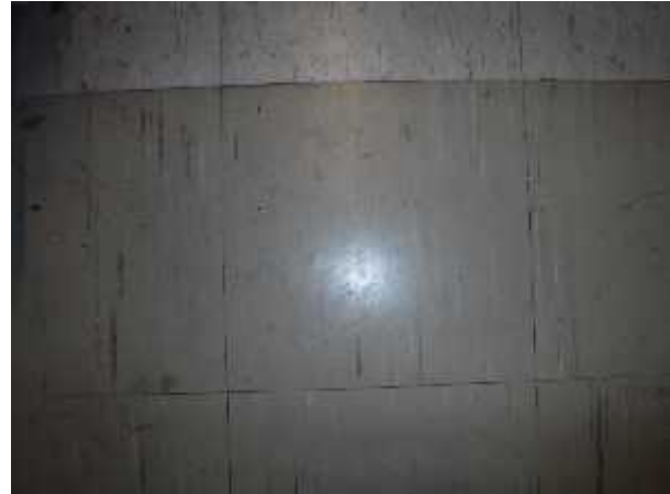
Photo 2 Description: Floor tile 2 – 12"x12" brown and beige with black smears Location: Autoshop Storage and Hot Water Tank Asbestos: Suspect