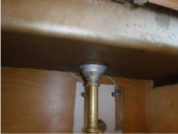
Photo 5 Description: Mastic 1 – Gold/silver Location: Drafting Classroom Asbestos: Suspect