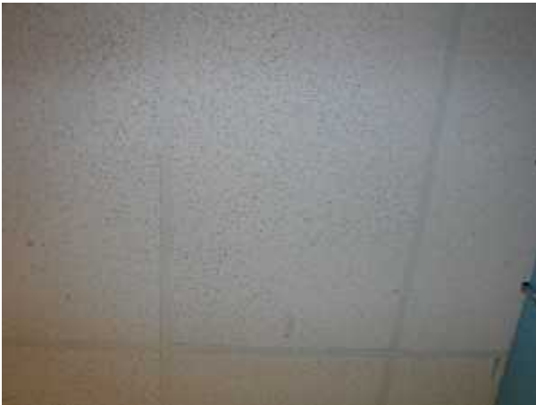
Photo 5 Description: Acoustic ceiling tile 1 – Patterned fissure small and large pinhole Location: Woodshop Classroom Asbestos: Suspect