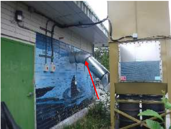
Photo 5 Description: Mastic 3 – Grey Location: Exterior Asbestos: Suspect