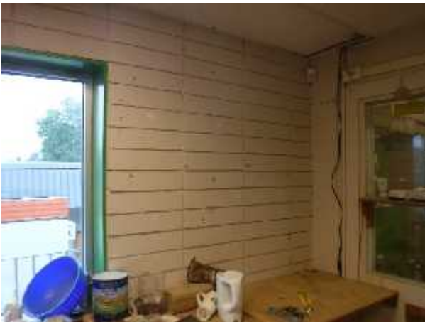
Photo 3 Description: Concrete block (may contain vermiculite) Location: Woodshop Office Asbestos: Suspect