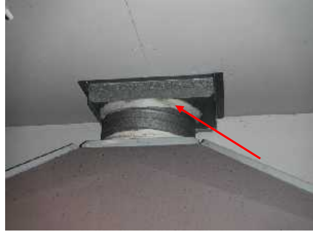
Photo 6 Description: Mastic 2 – Off white Location: Metal Shop Fume Hood Room Asbestos: Suspect