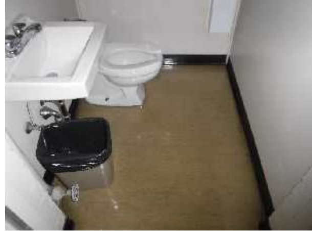
Photo 6 Description: Baseboard adhesive Location: Ladies Washroom Asbestos: Suspect