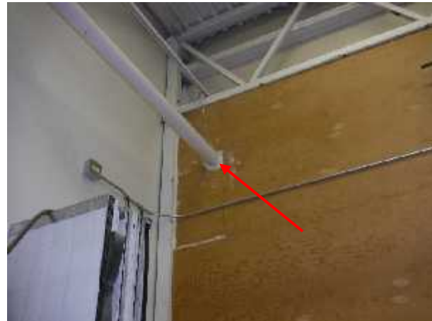
Photo 6 Description: Penetration caulking – White Location: Autoshop Loading Bay Asbestos: Suspect