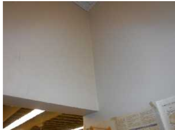
Photo 4 Description: Drywall with joint compound Location: Entrance to Woodshop Asbestos: Suspect