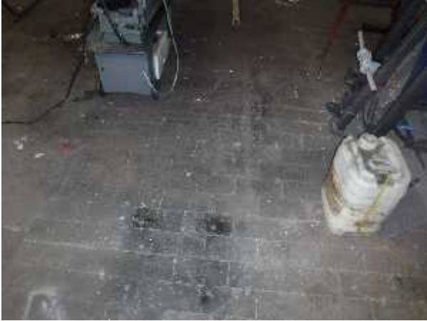
Photo 5 Description: Brick and mortar Location: Area Outside Metal Stock Rooms Asbestos: Suspect