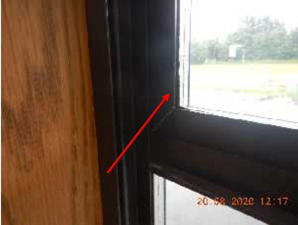
Photo 3 Description: Window Putty – Black Location: Classroom 4 Asbestos: Suspect