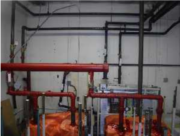
Photo 1 Description: Drywall Joint Compound Location: Boiler Room Asbestos: 1.7% Chrysotile Sample(s): 39999-5

The following photo plates provide a general documentation of the building materials that were sampled and analyzed, and observations made during the assessment. They are meant to summarize the results of analysis and observations and are not intended to include all hazardous materials, or their locations, observed during the assessment.