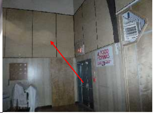
Photo 6 Description: Acoustic Panels (Gym Upper Wall) Location: Gym Asbestos: Suspect