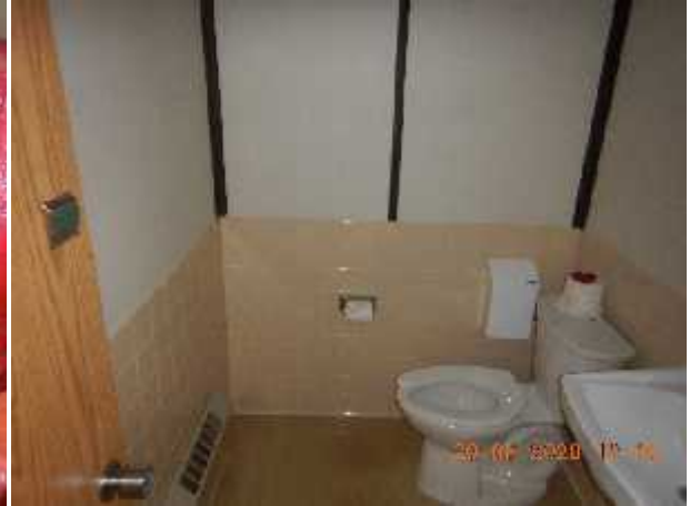
Photo 10 Description: Beige Ceramic Tile with White Grout and Thinset Location: Male Staff Washroom Asbestos: Suspect concealed asbestos leveling compound(s)