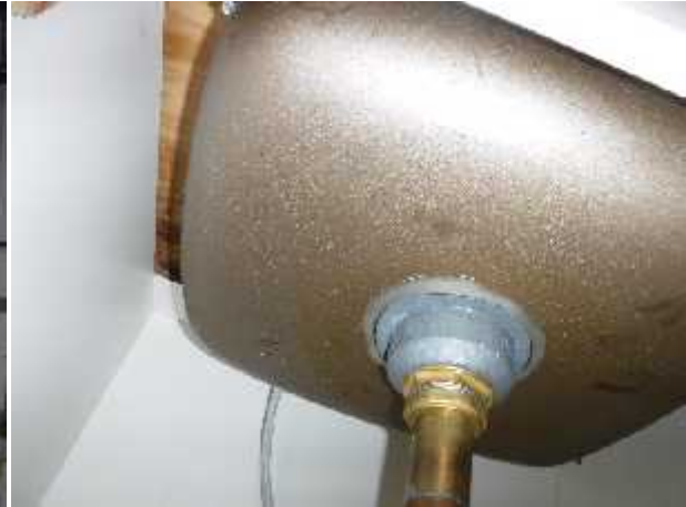
Photo 2 Description: Mastic Type 1 – Silver on Sink Location: Medical Room Asbestos: 1.5% Chrysotile Sample(s): 39957-16