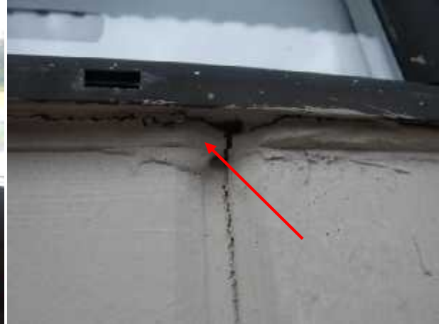
Photo 4 Description: Mastic Type 2 – Black Around Windows and Doors Location: Exterior Asbestos: Suspect