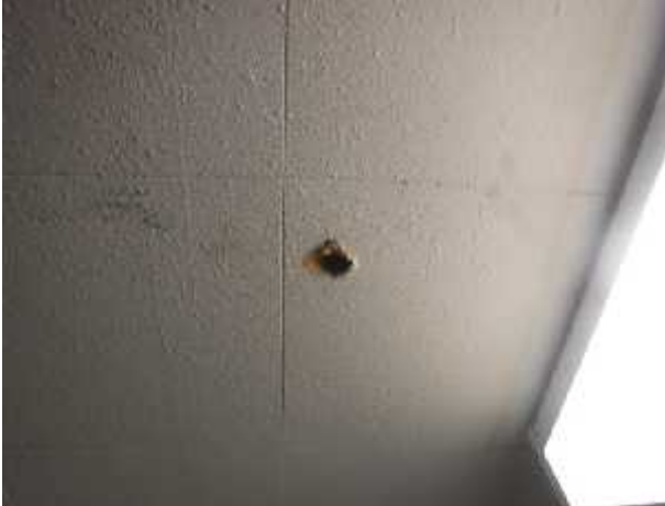
Photo 5 Description: Acoustic Ceiling Tile Type 3 - 12" x 12" Donnacona (Textured) Location: Storage Room Asbestos: Suspect