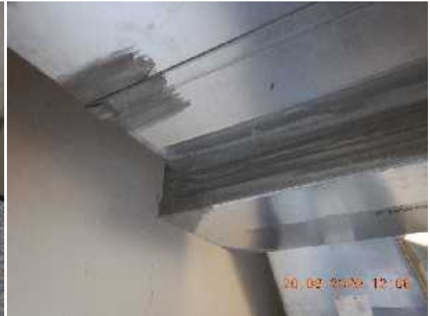
Photo 8 Description: Caulking Type 1 - Grey (On Ducting) Location: Classroom 3 Asbestos: Suspect