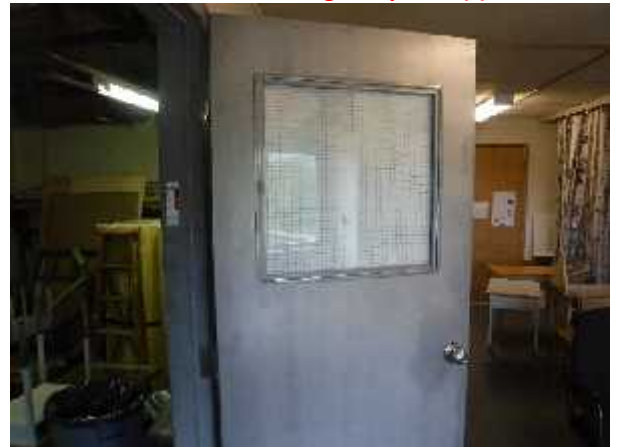
Photo 6 Description: Fire Door Location: Boiler Room Asbestos: Suspect