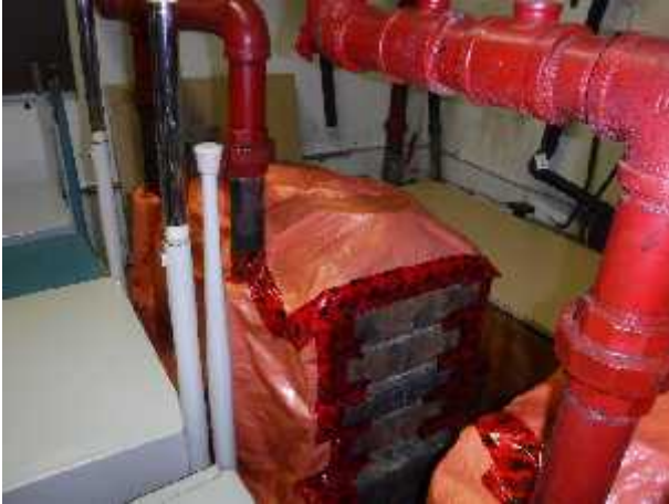
Photo 9 Description: Boiler Refractory Location: Boiler Room Asbestos: Suspect