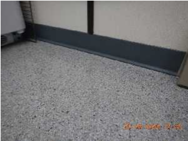
Photo 7 Description: Adhesive Type 1 - Baseboard Adhesive Location: Staff Lunch Room Asbestos: Suspect