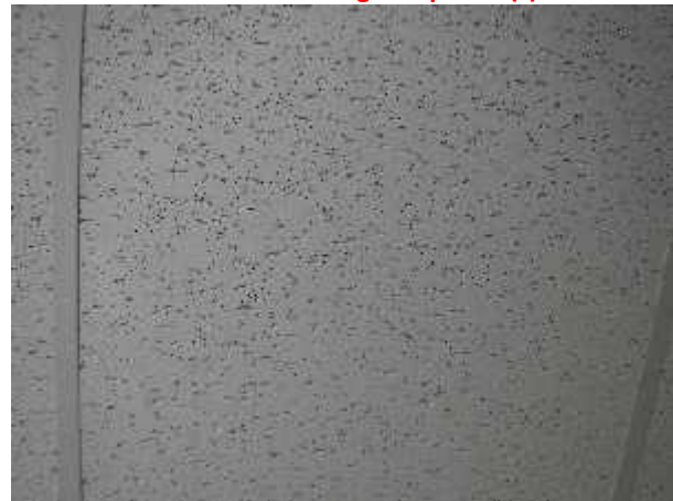
Photo 6 Description: 12 Acoustic ceiling tile type 4 – Lateral fissure small and large pinhole Location: Main Office Asbestos: Suspect