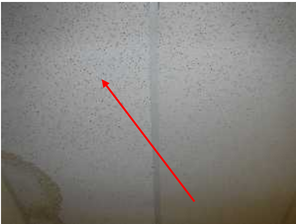
Photo 19 Description: Acoustic ceiling tile type 1 – Patterned fissure with small and large pinholes Location: Main Office Asbestos: Suspect