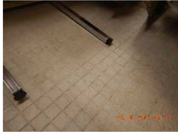
Photo 10 Description: Grey 2"x2" ceramic tile grout and thinset Location: Gym Storage Asbestos: Suspect concealed asbestos leveling compound(s)