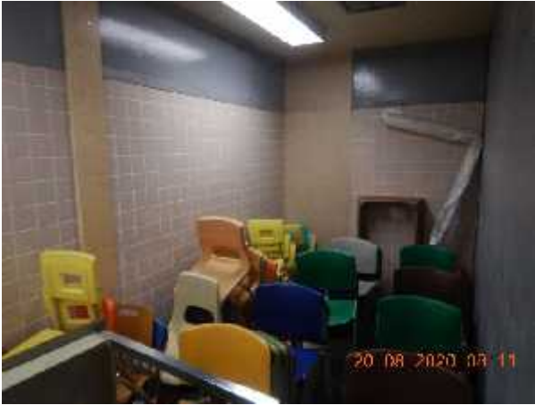
Photo 9 Description: Tan 5"x5" ceramic tile grout and thinset Location: Gym Storage Asbestos: Suspect concealed asbestos leveling compound(s)