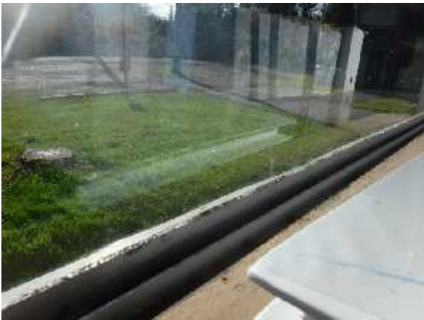
Photo 7 Description: Window Mastic – Black Location: Classroom 5 Asbestos: Suspect