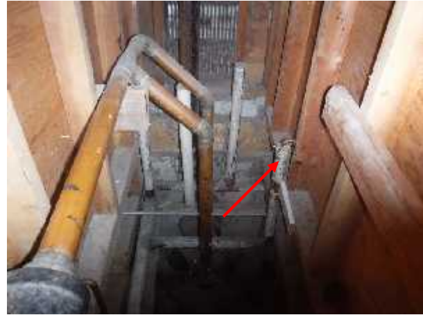
Photo 14 Description: Mastic type 1 – Black on pipe insulation Location: Janitor Room Pipe Chase Asbestos: Suspect