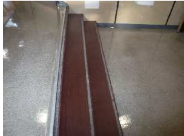
Photo 16 Description: Red brown stair tread Location: Foyer by Main Door Asbestos: Suspect