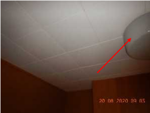
Photo 15 Description: Incandescent light gasket Location: Electrical Room Washroom Asbestos: Suspect