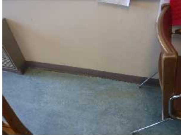
Photo 18 Description: Baseboard adhesive Location: Staff Kitchen Asbestos: Suspect