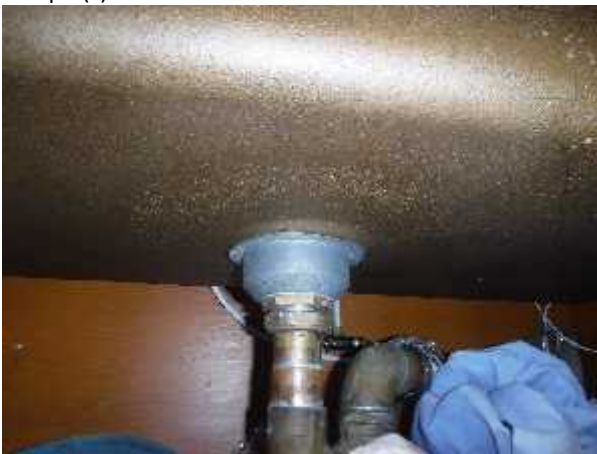
Photo 3 Description: Mastic – Gold Location: Classroom 2 Asbestos: 1.5% Chrysotile Sample(s): 30000-22