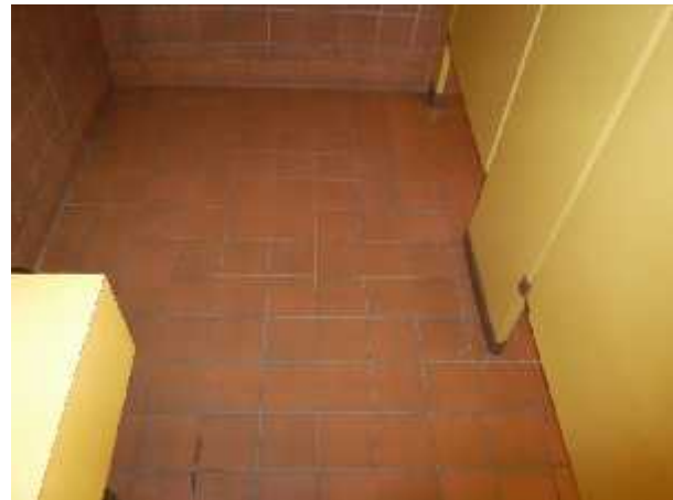
Photo 8 Description: Red 6"x6" ceramic tile grout and thinset Location: Boys Washroom Off Foyer Asbestos: Suspect concealed asbestos leveling compound(s)