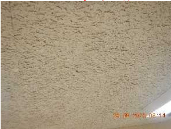
Photo 11 Description: Acoustic ceiling tile type 3 – 12"x12" donnacona textured with pinholes and fissures Location: Boys Gym Changeroom Asbestos: Suspect