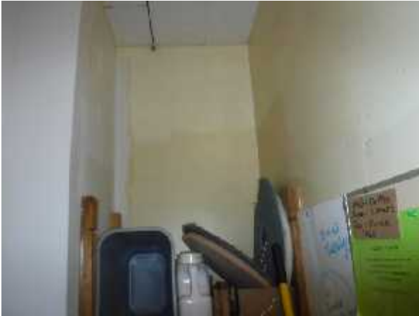
Photo 1 Description: Drywall joint compound Location: Janitors Room Asbestos: 1.8% Chrysotile Sample(s): 30000-18

The following photo plates provide a general documentation of the building materials that were sampled and analyzed, and observations made during the assessment. They are meant to summarize the results of analysis and observations and are not intended to include all hazardous materials, or their locations, observed during the assessment.