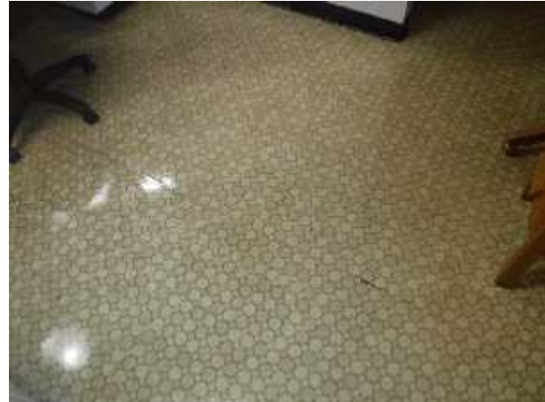
Photo 2 Description: Sheet flooring 8 – Circle pattern Location: Classroom 9 (Library) Asbestos: 10% Chrysotile Sample(s): 30000-21