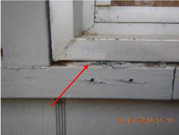
Photo 5 Description: Caulking – Grey Location: Exterior Asbestos: Suspect