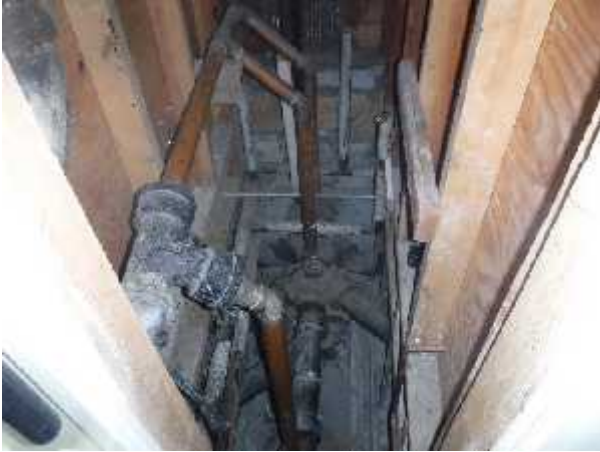
Photo 17 Description: Bell and spigot pipe gaskets Location: Janitor Room Pipe Chase Asbestos: Suspect