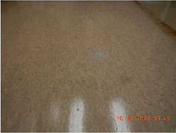
Photo 13 Description: Sheet flooring 4 – Beige-peach marble Location: Electrical Room Asbestos: Suspect