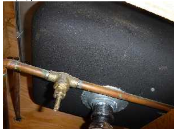
Photo 4 Description: Mastic – Black Location: Classroom 5 Asbestos: 2.5% Chrysotile Sample(s): 30000-25